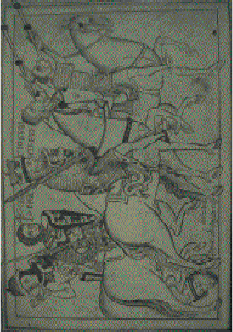
Figure 22 King Offa. Dublin, Trinity College Library Ms. 177 (Matthew Paris, Vie de Saint Aubain ), fol. 55v (c. 1250)