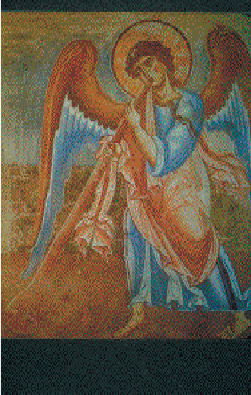
Figure 14 Last Judgment. Sant'Angelo in Formis (c. 1080) (detail) (fresco)