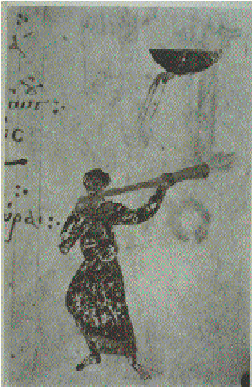
Figure 10 Man blowing trumpet. London, British Library Ms. Add.190352 (Theodore Psalter), fol. 188r (1066)