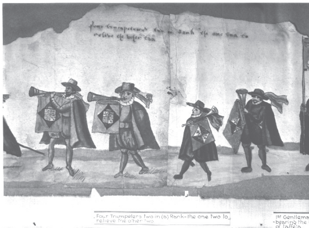
Figure 1 Scottish funeral procession, early 17th century

Four trumpeters, proceeding in pairs, are portrayed in two almost identical rolls depicting a Scottish funeral procession of the early 17th century (Figure 1). 7 The heraldry delineated has been interpreted as being intentionally vague and it is believed that the rolls were used as sources of reference for the preparation and marshaling of funerals. A note on one of the rolls referring to the funeral of the Marquis of Huntly in 1636 suggests that it was used on that occasion; however the costumes depicted appear to belong to a slightly earlier period. Only the first pair of trumpeters is actually playing, and a note on one of the rolls reads: “the one two to relieve the other two,” suggesting that the players played in alternation to produce continuous musical provision for the procession.